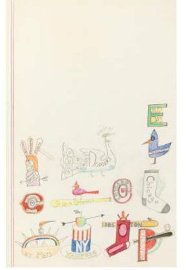
Untitled, 1978-85, 23 x 14 1/2 in.

Two vertical drawings are examples of compositions Steinberg made as covers for The New Yorker with extra space at the top to allow for magazine's masthead. One depicting a pile of baseball team logos in candy-colored crayons captures the artist's love of American teams and pastimes. The other, an ink drawing of a male figure in profile posed at the top of a staircase was published in Paul Tillich's My Search for Absolutes , 1967, an essay on existential philosophy.