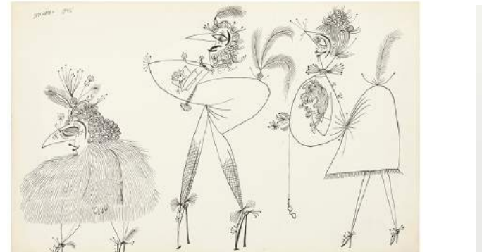
Three Women I, 1945, 14 1/2 x 23 inches

Steinberg often characterized hilarious personas, and his 1945 ink drawing Three Women I , celebrates three prancing buxom women with bouffant hairdos. In 1946 this drawing was included in the MoMA exhibition Fourteen Americans .