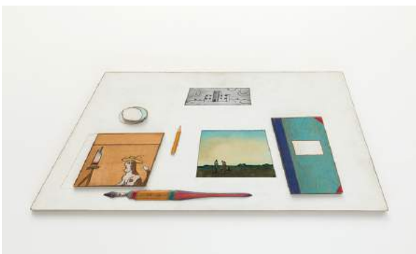
Perspective Table, 1982, 21 x 31 1/2 inches

Of particular interest in Steinberg's oeuvre are his tabletop assemblages in which he arranged groups of painted and raw wood faux objects. Imitating his own studio table as documented in photographs from the time, Steinberg fashioned whittled art tools, trompe l'oeil books, ledgers and other desktop miscellanea in perspective and then glued them onto panels. Among the individual objects on view are a quill pen, an early replica of a range finder camera, a sculptural recreation of Marty's Deli, small boxes and working clocks. In fabricating studio and household objects, as well as miniature copies of favorite buildings, Steinberg was deconstructing and reconstructing his particular worldview with originality and refracted humor.